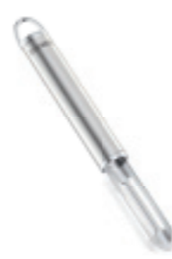
Peeler Sterling Article no. 24072 9, SU 6