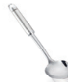
Vegetable spoon Article no. 24055 2, SU 6