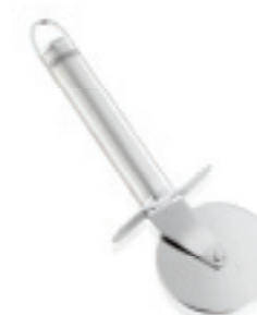
Pizza cutter Sterling Article no. 24067 5, SU 6