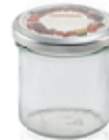
Jar for turning upside down 167 ml