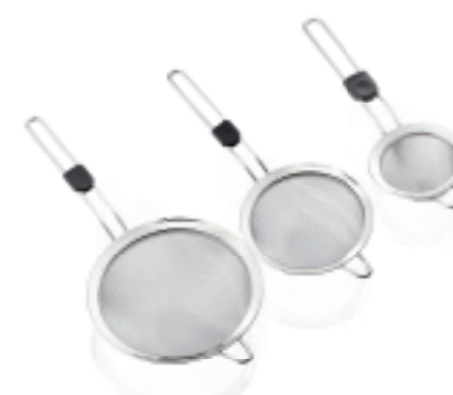
Kitchen strainers stainless steel

Small (Ø 7,5 cm): Article no. 21434 8, SU 6 Medium (Ø 16 cm): Article no. 21435 5, SU 6 Large (Ø 20 cm): Article no. 21436 2, SU 6