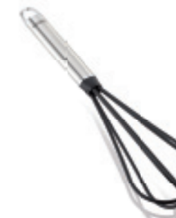
Whisk Nylon Article no. 24062 0, SU 6