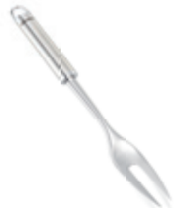
Meat fork Article no. 24053 8, SU 6