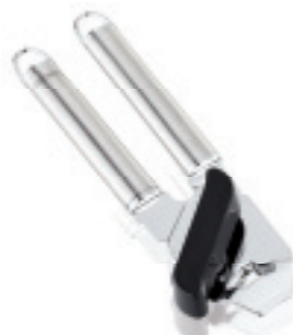
Tin opener Sterling > With million times proven cutting technology > Slim, elegant design > Stability and easy operation > With practical eyelet for hanging > 3 years guarantee Article no. 24068 2, SU 6