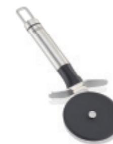
Pizza cutter stainless steel

Small (Ø 7,5 cm): Article no. 21434 8, SU 6 Medium (Ø 16 cm): Article no. 21435 5, SU 6 Large (Ø 20 cm): Article no. 21436 2, SU 6