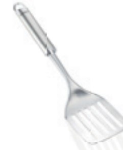
Spatula Article no. 24052 1, SU 6