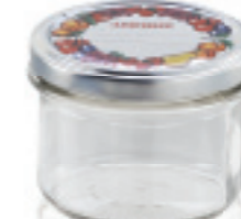
Jar for turning upside down 235 ml

Replacement lid with special coating: Article no. 36402 9, SU 10