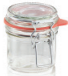
Wire bail jar 255 ml