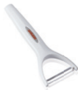
Y-peeler Article no. 03151 8, SU 6