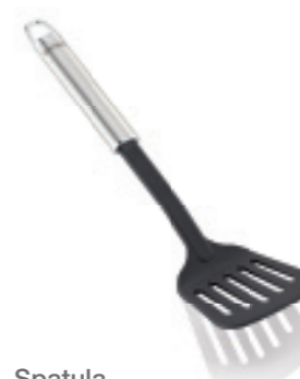
Spatula Article no. 24059 0, SU 6