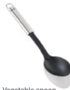
Vegetable spoon Article no. 24061 3, SU 6