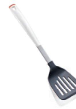
Spatula Article no. 03022 1, SU 6