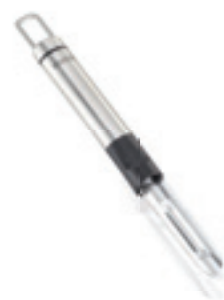
Potato peeler stainless steel Article no. 03127 3, SU 6