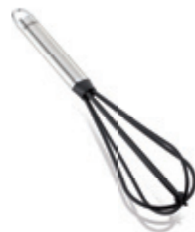
Whisk Nylon Article no. 24062 0, SU 6