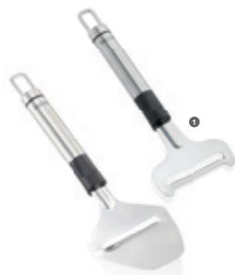
Cheese slicer stainless steel Article no. 03129 7, SU 6 ● Especially for young cheese Article no. 03130 3, SU 6