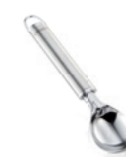
Ice cream scoop Sterling Article no. 24071 2, SU 6