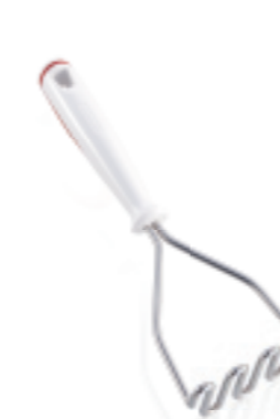
Potato masher Article no. 03185 3, SU 6