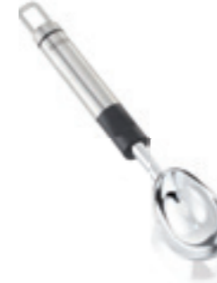
Ice cream scoop stainless steel

Normal: Article no. 03031 3, SU 6 Mini: Article no. 03030 6, SU 6