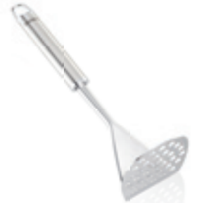
Potato masher Article no. 24074 3, SU 6