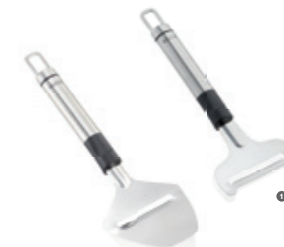
Cheese slicer stainless steel

› With nylon wheel for cutting directly on the sheet Article no. 03128 0, SU 6