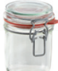
Wire bail jar 370 ml