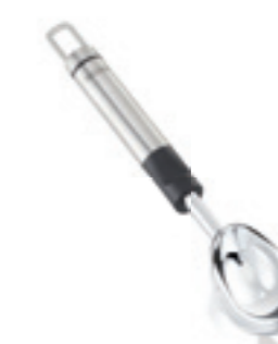
Ice cream scoop stainless steel Article no. 03062 7, SU 6