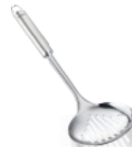
Skimming ladle Article no. 24051 4, SU 6