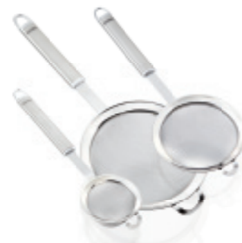
Kitchen strainers Sterling Small (Ø 7,5 cm): Article no. 24064 4, SU 6 Medium (Ø 11 cm): Article no. 24065 1, SU 6 Large (Ø 16 cm): Article no. 24066 8, SU 6