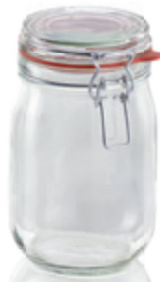
Wire bail jar 1140 ml

Replacement lids with special coating: Article no. 36402 9, SU 10