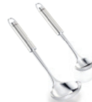
Ladle Small: Article no. 24087 3, SU 6 Large: Article no. 24050 7, SU 6