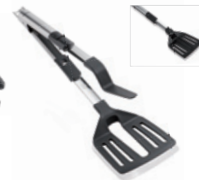
2 in 1-tongs turner stainless steel

Size S: Article no. 03041 2, SU 6 Size M: Article no. 03083 2, SU 6 Size L: Article no. 03078 8, SU 6