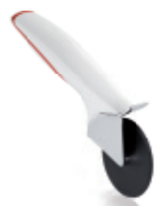
Pizza cutter > With nylon wheel for cutting directly on the sheet Article no. 03136 5, SU 6