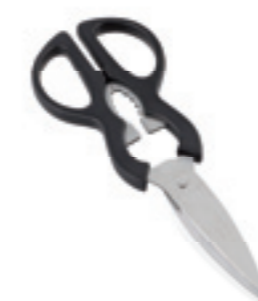
Household scissors > Also for the opening of screw tops > 3 years guarantee Article no. 03152 5, SU 6