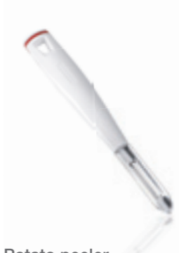
Potato peeler Article no. 03138 9, SU 6