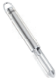
Peeler Sterling Article no. 24072 9, SU 6