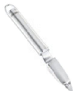
Swivel-bladed peeler Sterling Article no. 24073 6, SU 6