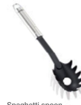
Spaghetti spoon Article no. 24060 6, SU 6