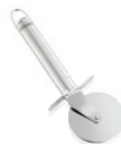
Pizza cutter Sterling Article no. 24067 5, SU 6