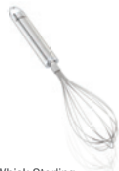
Whisk Sterling Length: 24 cm Article no. 24056 9, SU 6 Length: 32 cm Article no. 24077 4, SU 6