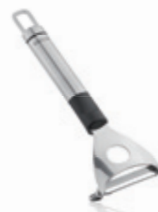
Y-peeler stainless steel Article no. 03158 7, SU 6