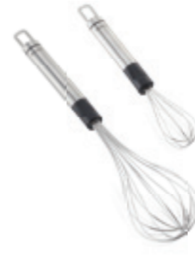
Whisk stainless steel

Normal: Article no. 03031 3, SU 6 Mini: Article no. 03030 6, SU 6