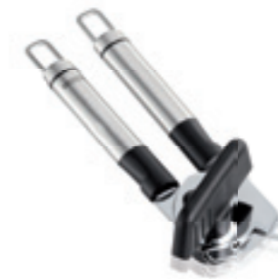
Can opener stainless steel

› See page 106 Article no. 03125 9, SU 3