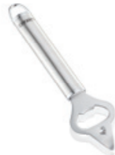
Bottle opener Sterling > 3 functions: bottle opening, tin punching and screw top opening > With practical eyelet for hanging > 3 years guarantee Article no. 24069 9, SU 6