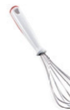
Whisk Article no. 03184 6, SU 6