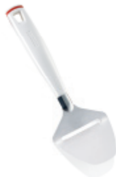
Cheese slicer Article no. 03188 4, SU 6