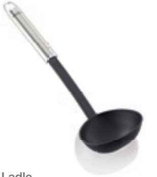
Ladle Article no. 24057 6, SU 6