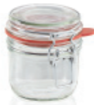
Wire bail jar 135 ml