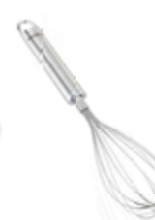
Whisk Sterling 24 cm: Article no. 24056 9, SU 6 32 cm: Article no. 24077 4, SU 6