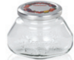
Preserve jar 250 ml

Replacement lid with special coating: Article no. 03177 8, SU 10