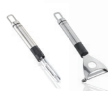
Potato peeler stainless steel