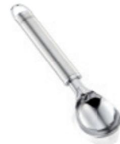
Ice cream scoop Sterling Article no. 24071 2, SU 6