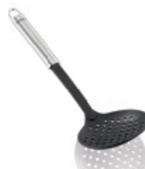
Skimming ladle Article no. 24058 3, SU 6