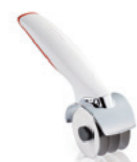
Herb cutter > Four sharp blades cut the herbs finely > With blade protection Article no. 03144 0, SU 4