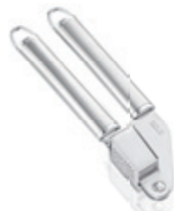
Garlic press Sterling > Easy to clean because of removable inserts > For the pressing of whole garlic cloves > Dishwasher-safe > 3 years guarantee Article no. 24070 5, SU 6