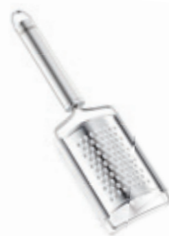
Nutmeg grater Sterling > For the grating of nutmeg directly while preparing > With practical eyelet for hanging > 3 years guarantee Article no. 24063 7, SU 6