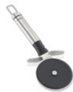
Pizza cutter stainless steel > With nylon wheel for cutting directly on the sheet Article no. 03128 0, SU 6