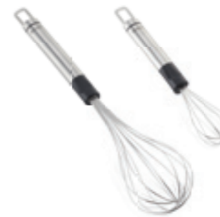
Whisk stainless steel Normal: Article no. 03031 3, SU 6 Mini: Article no. 03030 6, SU 6