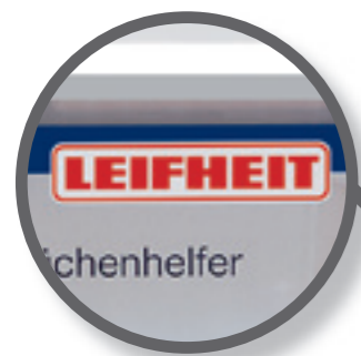
Shelf head blinds + Shelf stopper