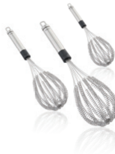
Whisk Speed Quirl stainless steel > Whisks as twice as fast as conventional whisks > Perfect airy results thanks two special twirled wires > 3 years guarantee Small: Article no. 03097 9, SU 3 Medium: Article no. 03098 6, SU 3 Large: Article no. 03099 3, SU 3