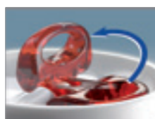
Very easy one hand opening mechanism